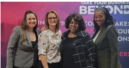
Prince William County, Dept of Economic Development

The HUBZone Contractors National Council is a non-profit trade association providing information and support for companies and professionals interested in the HUBZone Program. Our mission is to assist small businesses from distressed areas maximize their success in earning federal contracts so that they may restore jobs and economic stability to those communities that need it the most.