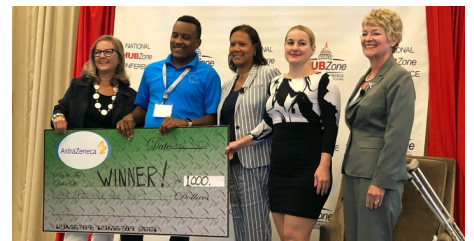
Pitch Competition at 2021 National HUBZone Conference